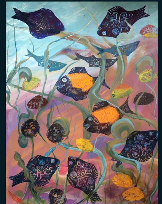
Living in Harmony, Mixed Media 2014