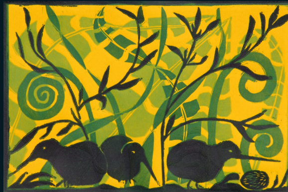
Kiwi Birds, Three plate lino cuts 2009