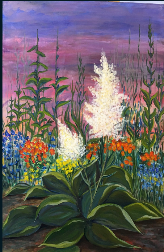
Height of Summer, Acrylic Painting 2019